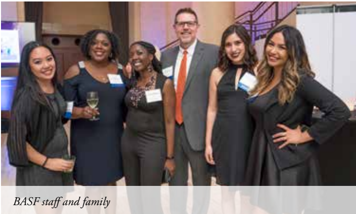
BASF staff and family